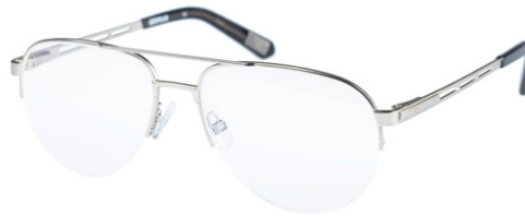
CTO-PROGRAMMER-002 Matte gun / Gloss blue and red