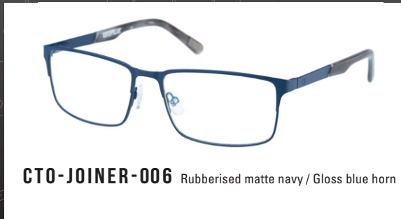
CTO-JOINER-006 Rubberised matte navy / Gloss blue horn