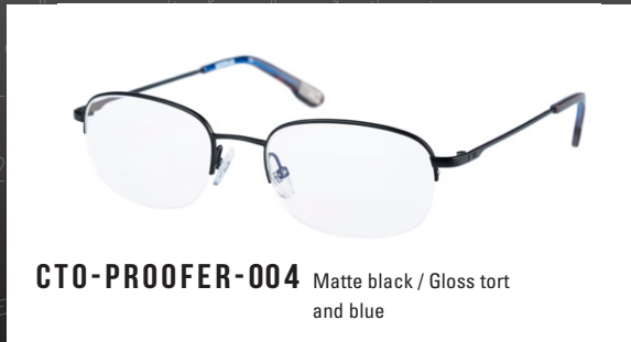
CTO-PROOFER-004 Matte black / Gloss tort and blue