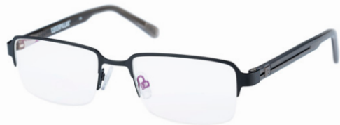
CTO-PRENTICE-004 Matte black / Gloss grey horn