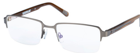
CTO-PRENTICE-005 Matte gun / Matte and gloss brown crystal and painted grey