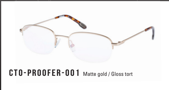
CTO-PROOFER-001 Matte gold / Gloss tort