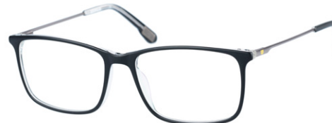
CTO-DRAFTER-104 Matte black - crystal / Matte silver