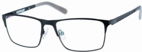
CTO-FITTER-004 Matte black / Gloss black horn