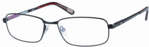
CTO-SETTER-004 Matte black / Gloss black and red