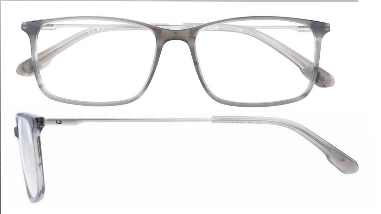
CTO-DRAFTER-108 Gloss grey horn / Matte silver