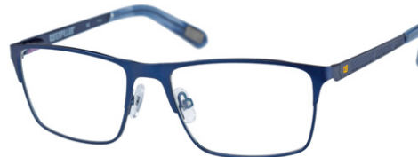
CTO-FITTER-006 Rubberised matte navy / Gloss blue horn