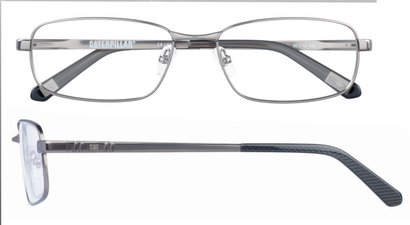
CTO-SETTER-005 Matte gun / Gloss black carbon effect