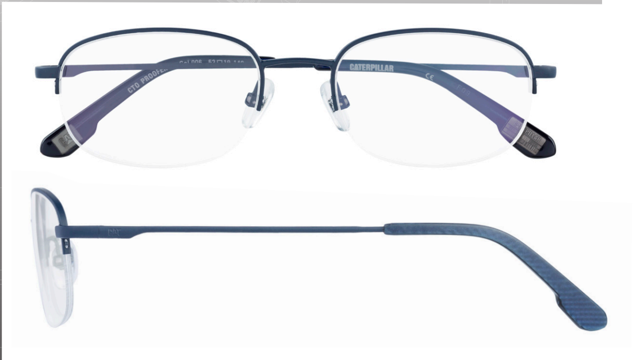
CTO-PROOFER-006 Rubberised matte navy / Matte black carbon effect and navy