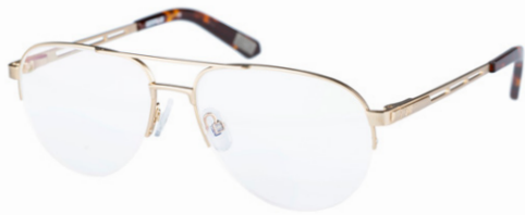
CTO-PROGRAMMER-001 Matte gold / Gloss tort