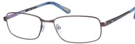
CTO-SETTER-010 Matte titanium / Gloss blue tort