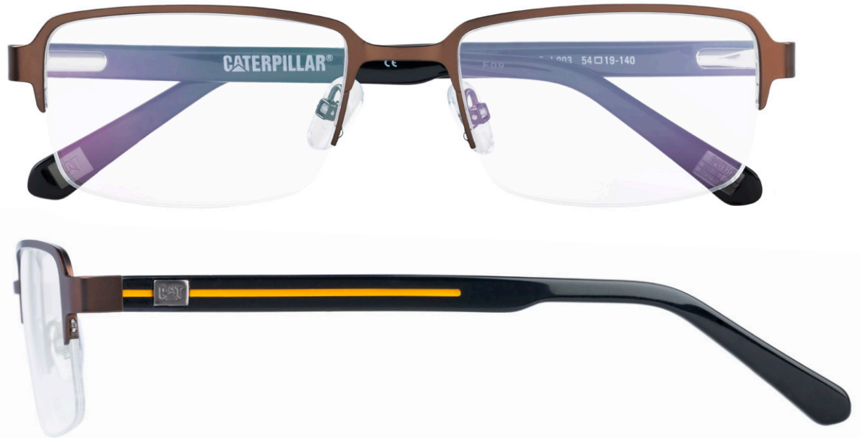
CTO-PRENTICE-003 Matte brown / Gloss black and painted yellow