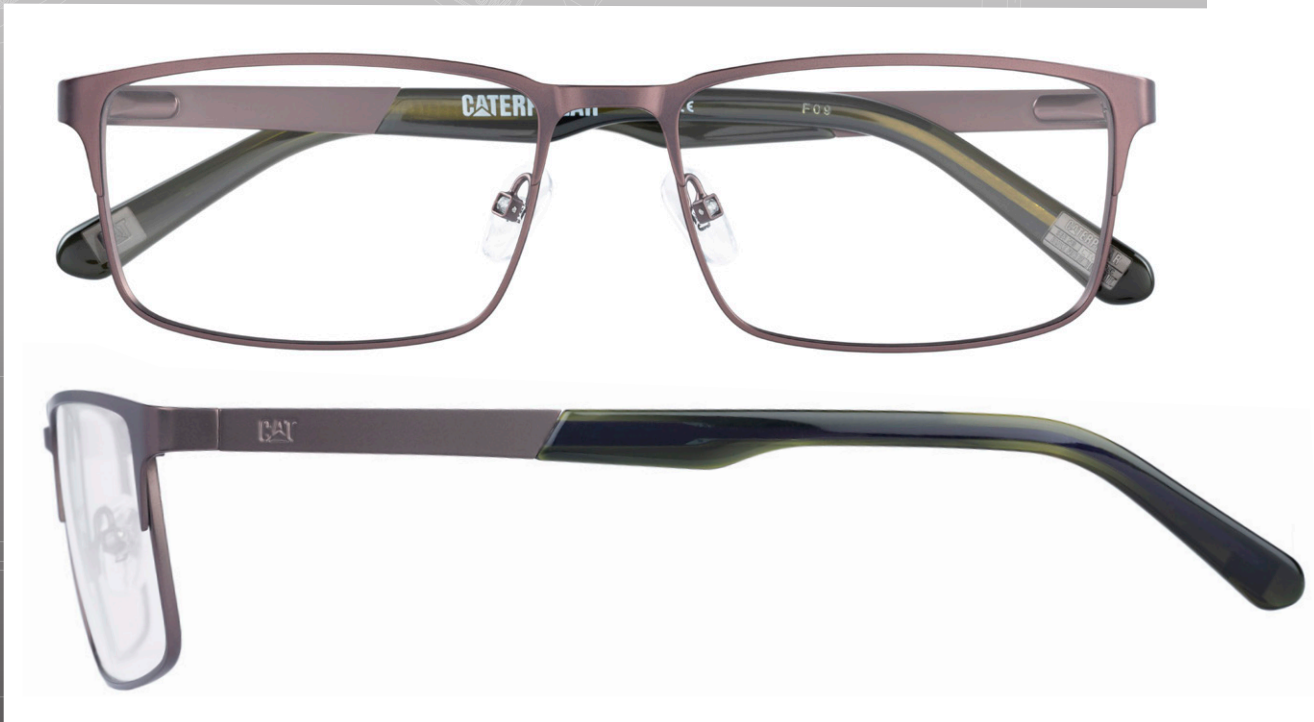
CTO-JOINER-010 Matte titanium / Gloss black and green