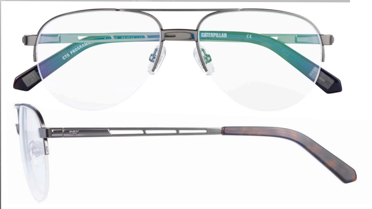
CTO-PROGRAMMER-005 Matte gun / Toty blue crystal