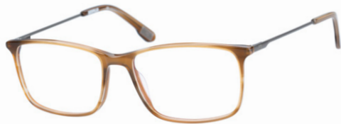
CTO-DRAFTER-103 Gloss brown horn / Matte gun