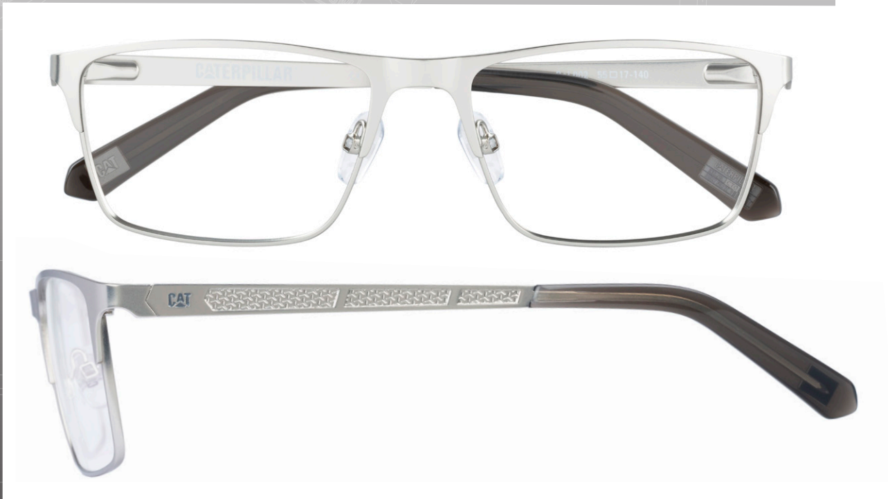
CTO-FITTER-002 Matte silver / Gloss grey horn